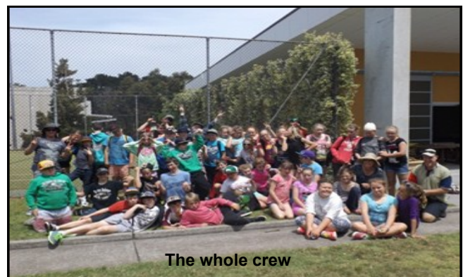
The whole crew