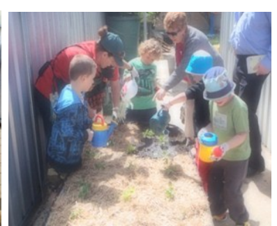
Our new vegetables.

Once that corner was completed and looking amazing our next task was a very overdue working bee over the weekend. We replaced our very old sandpit with a beautiful natural stone sandpit. We were able access the stones for free and Divalls (Goulburn Sand and Soil) provided the sand for free. Plants and slide were provided by the Tea Pot Ladies. Thank you very much.