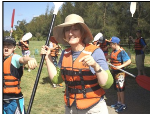
Year 6 Camp