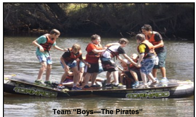
Team "Boys—The Pirates"