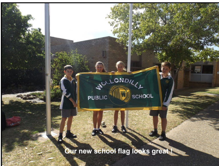
Our new school flag looks great!