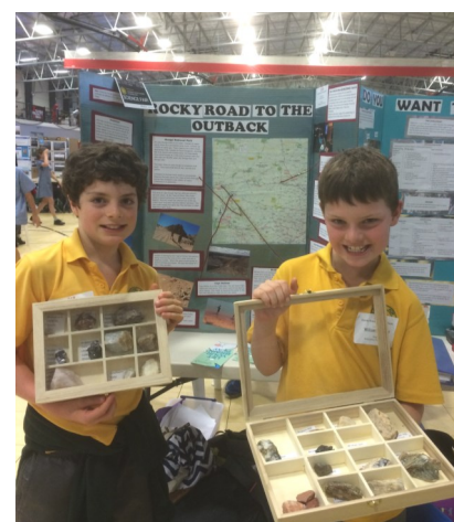
Young Scientists at University of Wollongong.