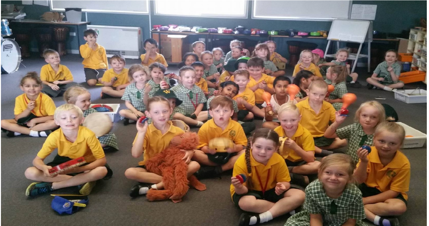
K-2 Lunch time percussion group