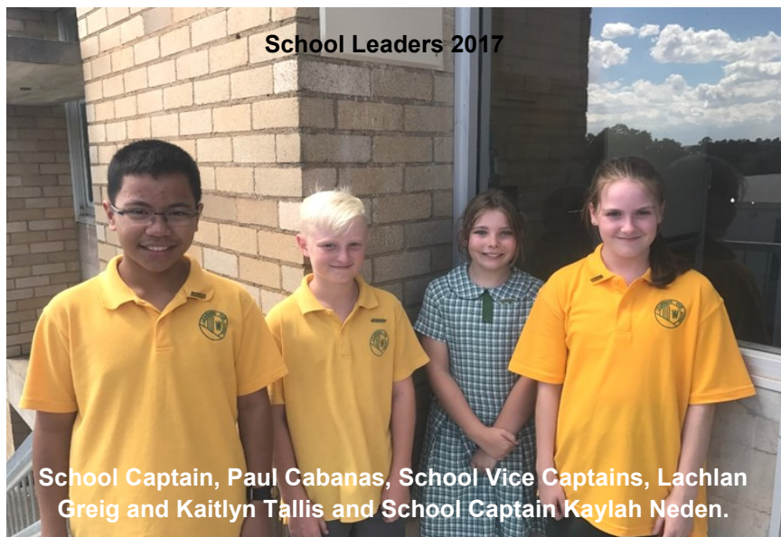
School Leaders 2017