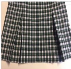
Pleats at the front and back