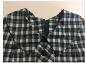
Pointed Peak Collar with Piping