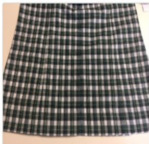
Pleats at front and straight back