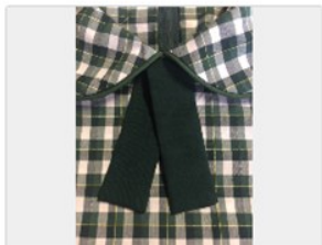
Green tab tie