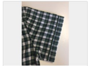
Green piping on sleeve