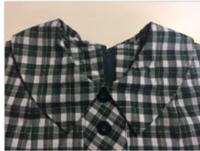
Pointed Peak Collar