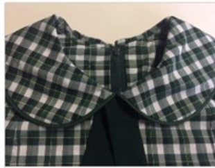
Peter Pan collar with Piping