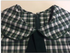
Peter Pan Collar