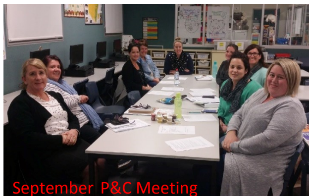
September P&C Meeting

Current Requests. As part of being more environmentally responsible at Wollondilly we would like to build up a collection of coffee mugs that we can use when holding events serving hot drinks for visitors. If you are ever cleaning out your cupboard and need to make more room, we would gratefully receive any excess mugs that you would like to part with.