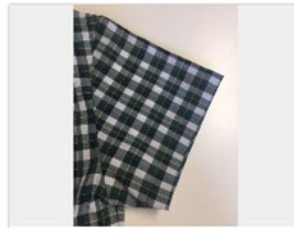
No piping on sleeve